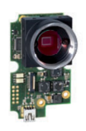
USB uEye ME OEM 1 boardlevel CMOS and CCD